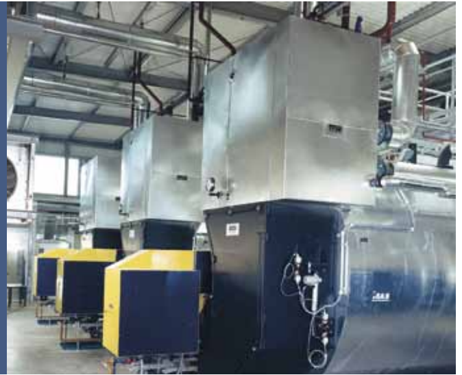
Figure 2: Three steam boilers UL-SX for superheated steam in the paper industry

Latest generation paper making machines are designed for paper webs of up to 10 metres in width in combination with speeds of up to 2000 metres per minute and they are only able to demonstrate their best performance with suitable boiler systems. Even for these most modern and very large paper production machines Bosch Industriekessel has suitable boiler systems with proven firing systems and controls. Using the standard well proven designs at standard design pressures, the user can have complete confidence in the safety and performance of the boiler systems. Correctly dimensioned and control-switched, the UNIVERSAL series boiler fulfils all the demands.