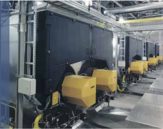
Figure 1: Four Double-Flue Boilers UNIVERSAL ZFR with a steam output up to 120 t/h in the paper industry