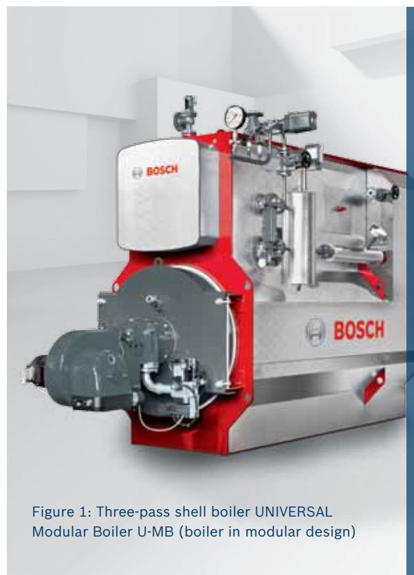
Figure 1: Three-pass shell boiler UNIVERSAL Modular Boiler U-MB (boiler in modular design)

Shell boilers, also called flame tube boilers, are considered easy to operate and maintain, resistant, rough and long-lasting. Even with changing loads they provide a high-pressure stability and good steam quality. In the long history of steam boiler technology this design type, particularly the three-pass flame-tube boiler, was able to assert itself due to the high energy utilisation and low emission rates. Thus, the boilers used for medium to high steam capacities of up to 55 000 kg/h are almost exclusively three-pass flame-tube boilers. However, for smaller steam quantities of up to approx. 2 000 kg/h, a multitude of steam boiler designs are competing on the market. This is mainly due to the demanding production processes for three-pass shell boilers compared to less complex designs. The U-MB three-pass shell steam boiler is a revolution in the market for steam generators in this performance range.