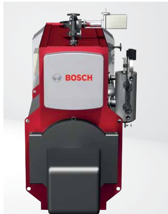
Figure 3: UNIVERSAL Modular Boiler U-MB (boiler in modular design) –unique in design and all other features

The UNIVERSAL U-MB provides the customer with unmatched steam generator qualities in this class. Thanks to the modular design, the U-MB can be exactly aligned with customer requirements without having to sacrifice the benefit of cost advantages due to large quantities. The result is a steam boiler that matches any large industrial boiler series in function and quality any time.